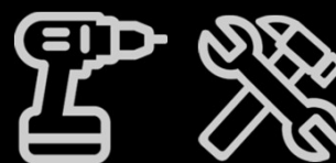
HAND AND POWER TOOLS

Crealty CR-10 Smart Pro, Delta WASP 2040, Creality Halot-Lite